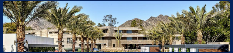
Arizona Biltmore, A Waldorf Astoria Resort

NORTH AMERICAN SUPPLY CHAIN EXECUTIVE SUMMIT NASCES24 September 16-18, 2024 | Phoenix, AZ