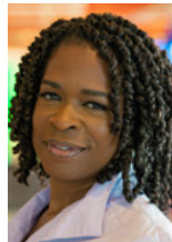
Monique Picou EVP, Cloud Supply Chain & Operations Google